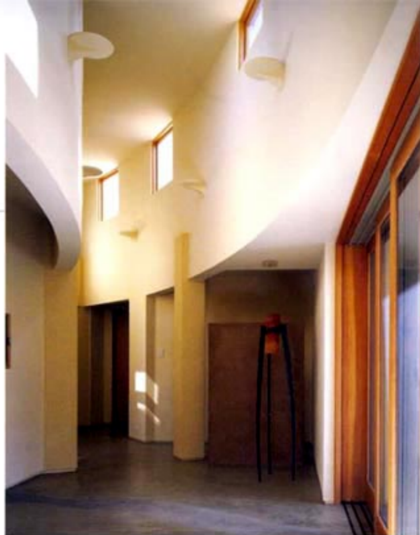
ABOVE: The curvilinear gallery, acting as a main street connector to the destinations within, creates a central ribbon of circulation. Palm Desert, California.